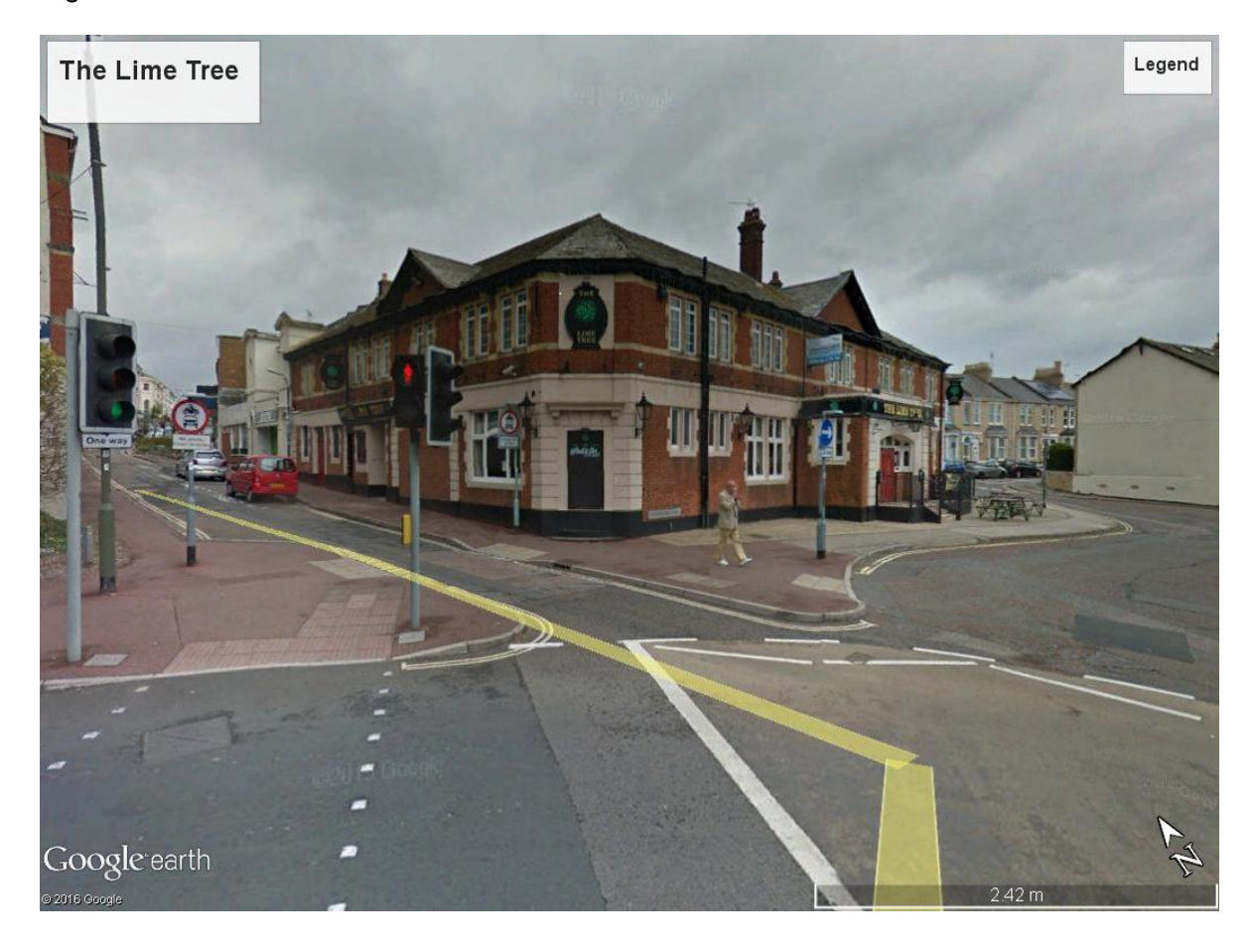
Fig 1 - Street view of the Lime Tree